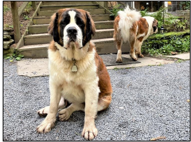
"Uh-Oh!" Double trouble, they've got bones in em.