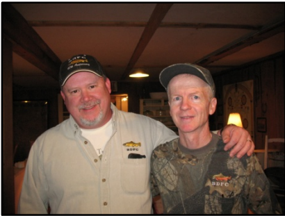
THE COVERALL BOYS