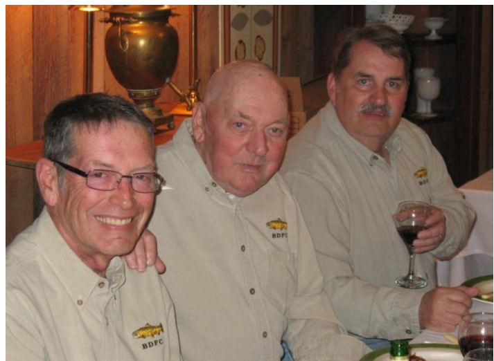
And his faithful troopers - Larry, Curly and Moe