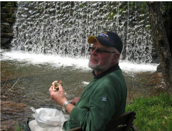
I met a leprechaun - having lunch along the stream