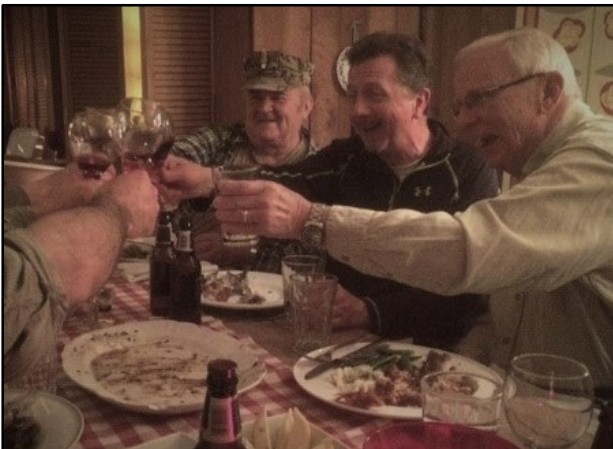
A toast was made to another great time together, it