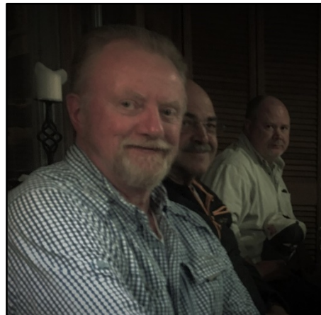
"Houston!" We have an acute flatulation