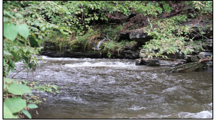
The picture above is a view of Vly Creek off Rte-28 in Fleischmanns. As I said, one would be hard pressed to get into the stream anywhere along this stretch.