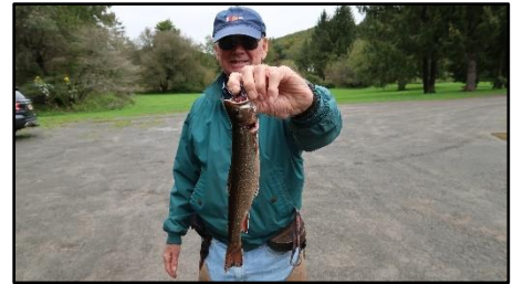
"Bingo" – nice brookie