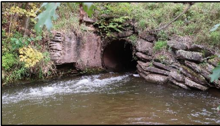
What a beautiful hole that is

I replied, "Don't worry about that. But it's of utmost importance, that she sees what happens to a man after he gives up drinking, golfing and fishing! "