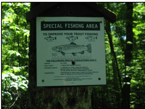
Always a nice sign to see