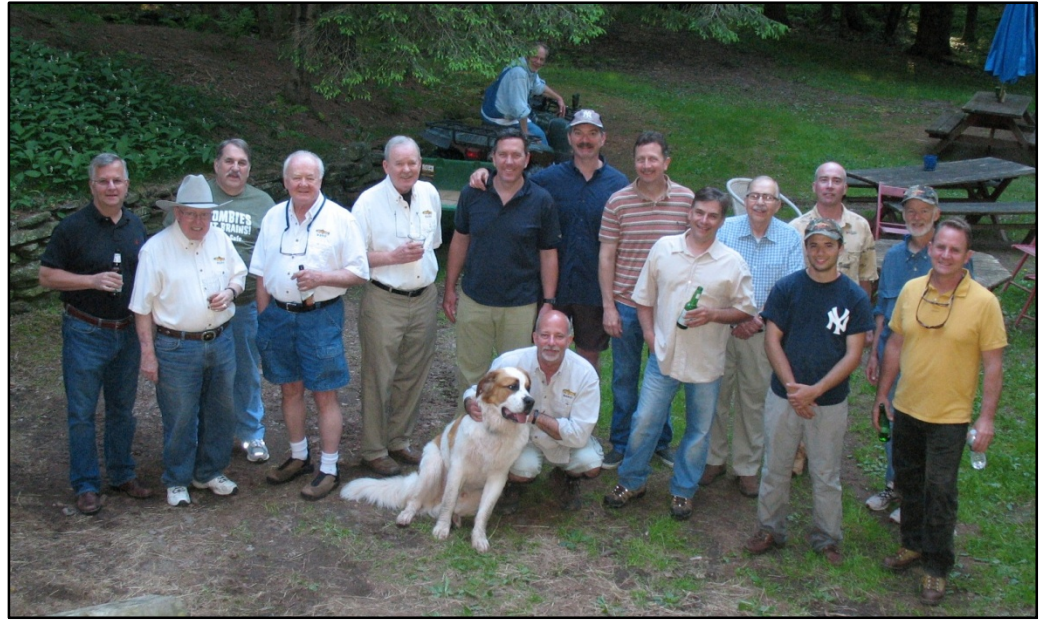
The Boys of Summer