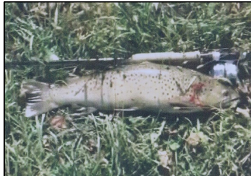
22 inch Brown Trout