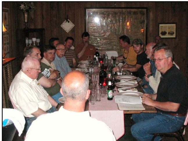
Waiting for the opening bell