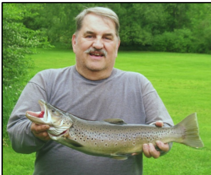
23 7/8 inch Brown Trout