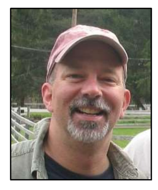
See you soon my friends,

Which brings us to where we are now. I am hopeful, that banding together as a Club we can see these tragic circumstances through. So, looking forward, let us keep our heritage alive and continue down this path of fellowship as we celebrate together – arm in arm at our oasis in the Catskills – The Mountain Brook Inn.