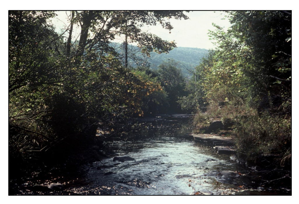
As the leaves start falling and float down stream, you know it's time to get out after those big ones. So with that said,