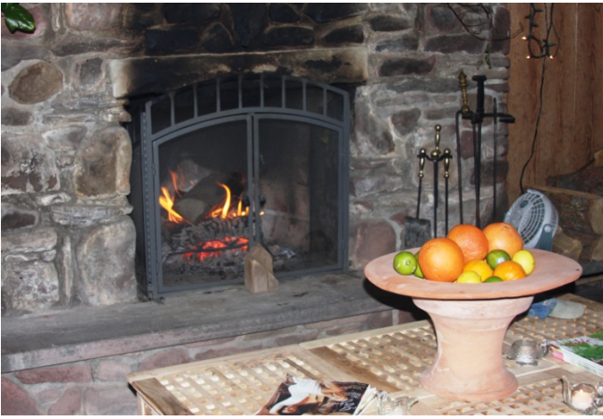
The ambience of a nice fire