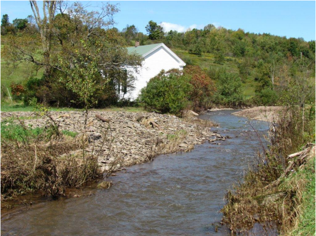
This is a picture behind the church along the upper Batavia Kill, notice that all the great holes are now washed out as a result of the flooding that took place