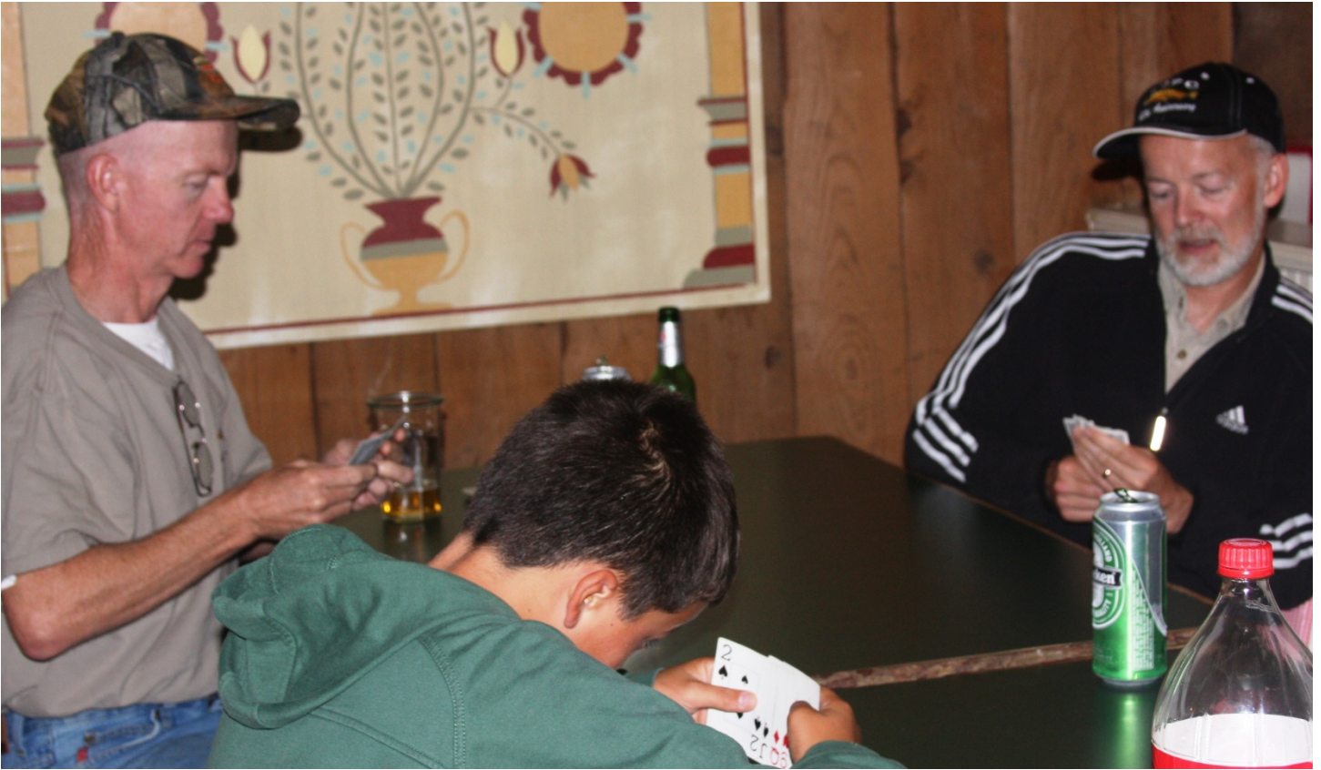
And the pitch game went late into the evening with the Grimes boys sticking it out!