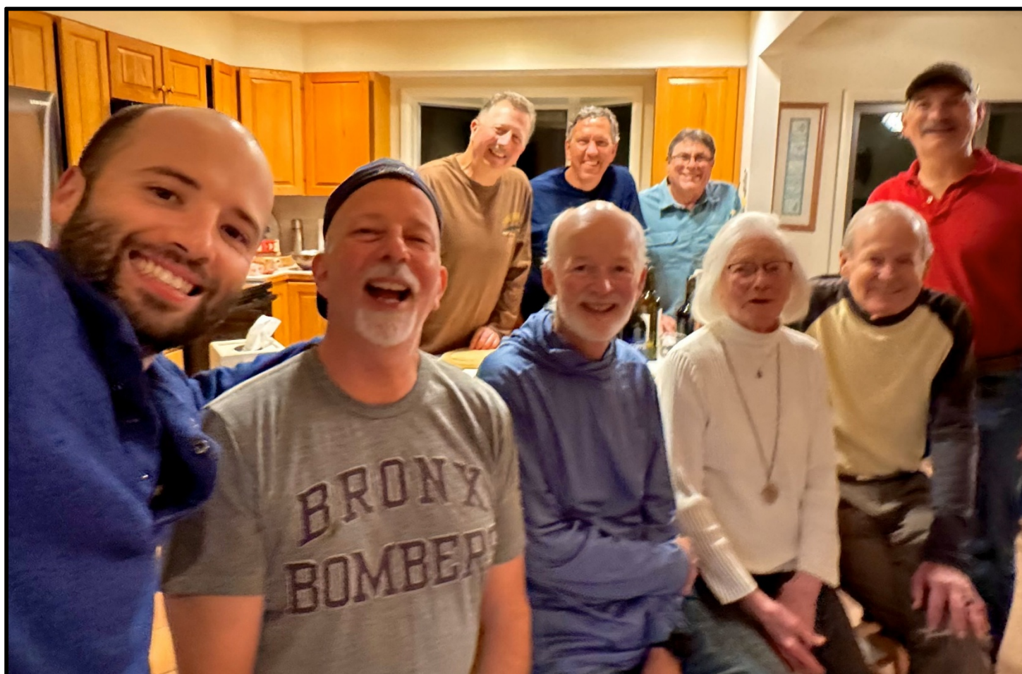
Group picture of Thursday night Tunis Lake BBQ and Grill at Castle Grimes