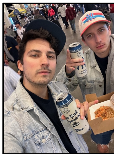
Not to be left out, the Crowley boys are close behind