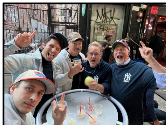
Now an after tour stop for some Adult Beverages. "Thirsty yah Know!"