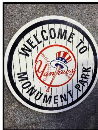
Next day, on to Yankee Stadium and a tour of Monument Park