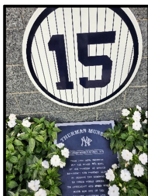
Thurman Munson's plaque Lifetime .306 batting average