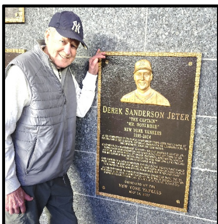
The Captain, Derick Jeter's plaque